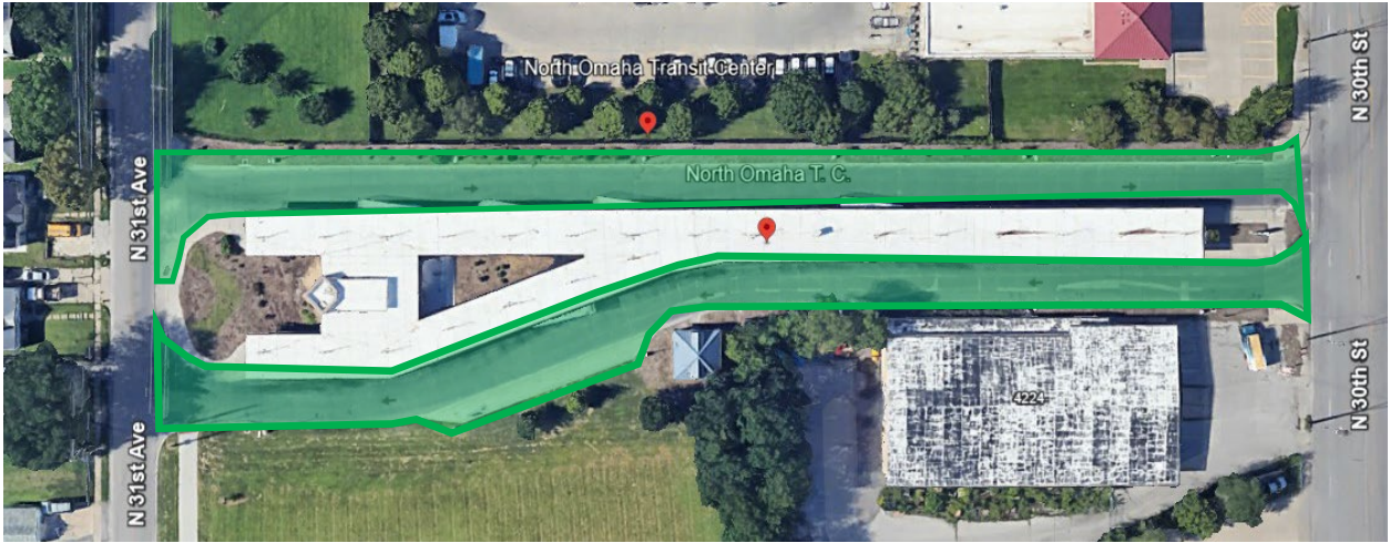
North Omaha Transit Center Pavement Replacement Limits