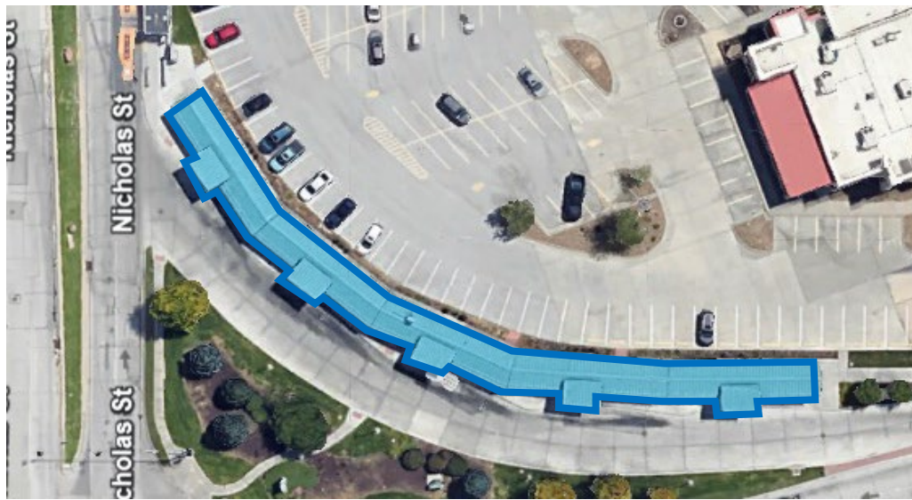
Westroads Transit Center Painting Limits