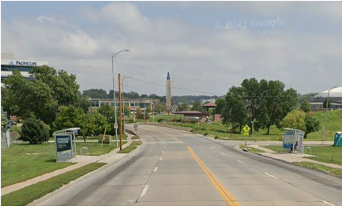
Aksarben Transit Center – 67 th and Mercy