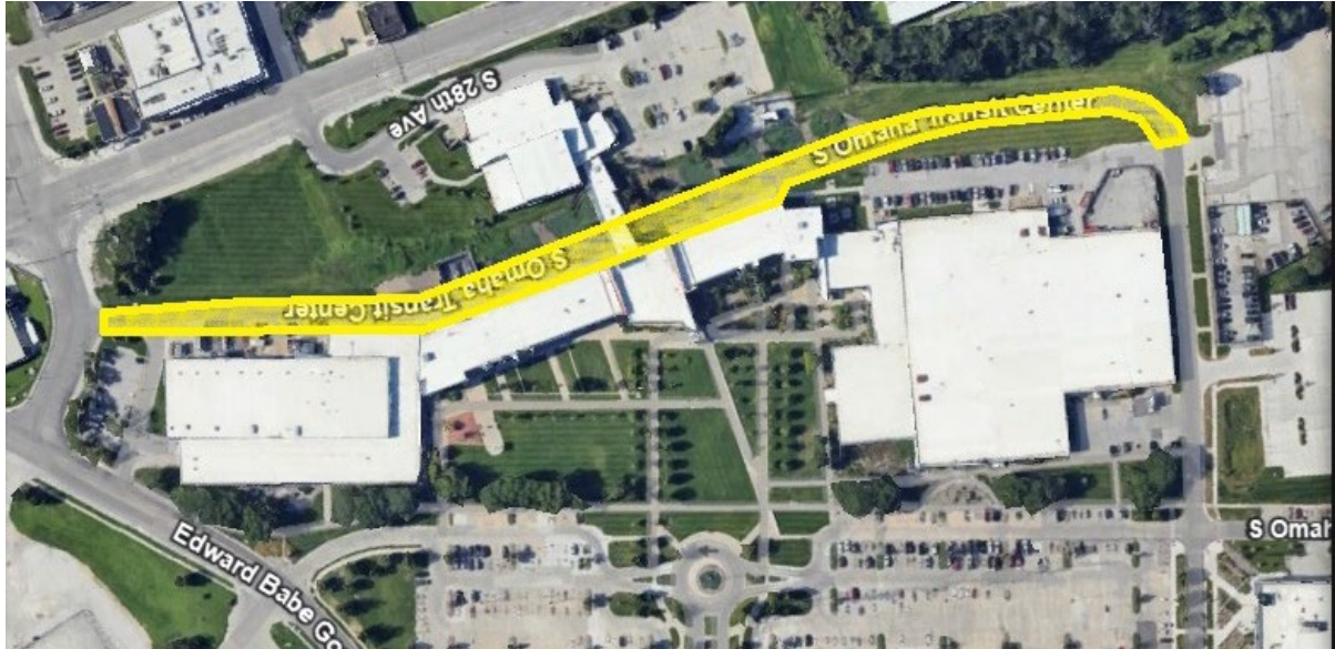
Metropolitan Community College Pavement Replacement Limits