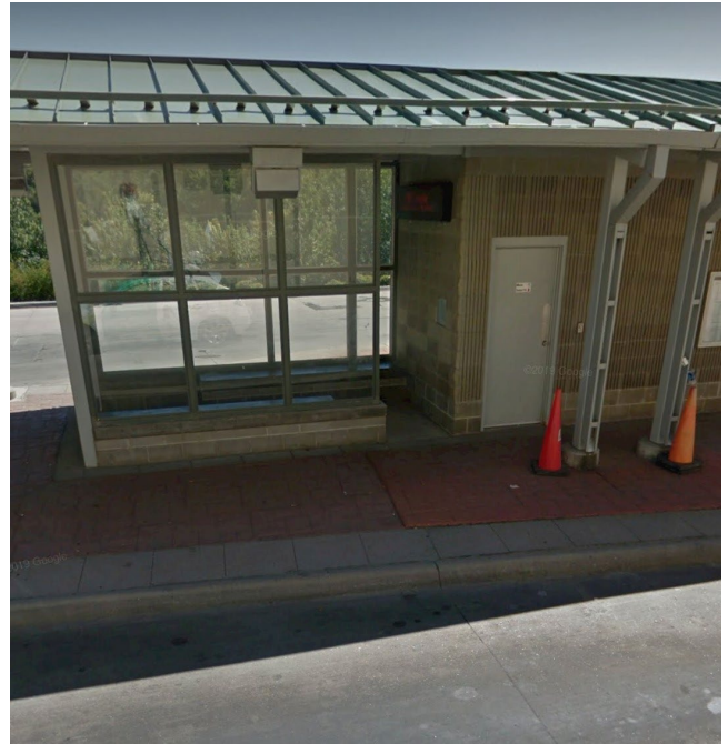
Waiting Area and Electrical Room