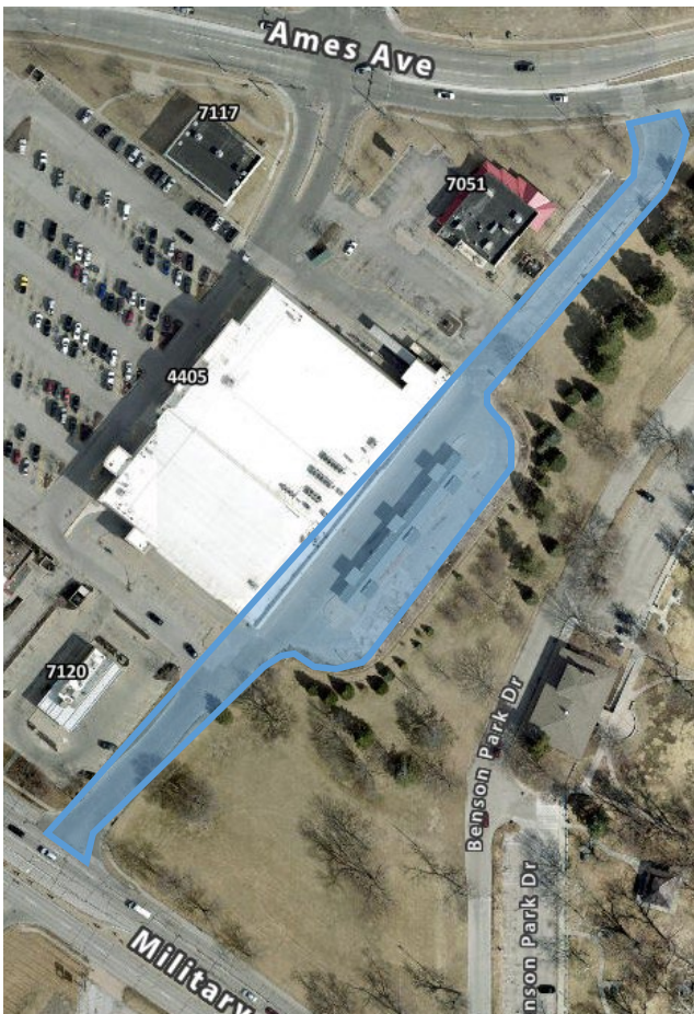
Benson Park Transit Center Aerial