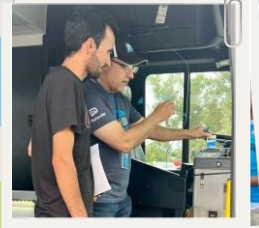
WORLD REFUGEE DAY