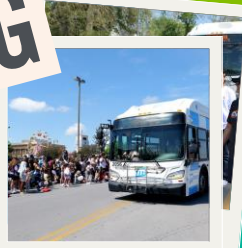
CINCO DE MAYO PARADE