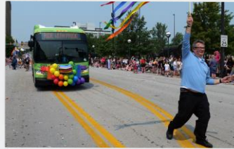
HEARTLAND PRIDE PARADE